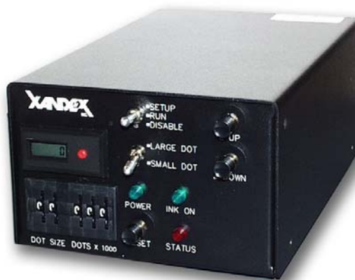
Motor-Z Pneumatic Controller